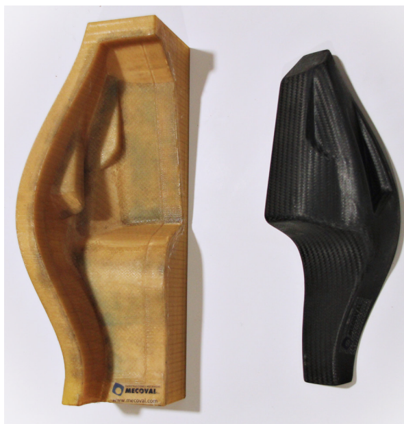
3D printed composite layup tool produced in ULTEM™ 9085 resin, alongside the final carbon-fiber part for use in Formula One racing.

The Fortus 450mc is also employed to produce sacrificial tools using an advanced soluble material, ST-130, to make composite parts with complex geometries. The carbon fiber composite material is wrapped around the mold, and once cured, the internal sacrificial core is washed away leaving the final composite part. Enguix explains, "We were recently tasked by one of our automotive customers to produce a complex duct in carbon fiber. Using our traditional CNC process, this would have taken two weeks and been a very costly exercise. Using the Fortus 450mc, we were able to print the soluble tool and have a final carbon-fiber part in our hands within days, and at a fraction of the cost."