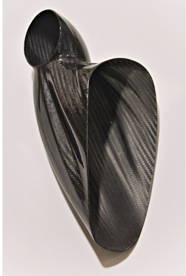
Carbon fiber duct for an automotive customer, produced using a 3D printed sacrificial tool in ST-130 soluble material.

Enguix concludes, "Stratasys' diverse range of production-grade materials was key in our decision to choose the Fortus 450mc over a lower-cost professional desktop 3D printer. I firmly believe that 'you get what you pay for,' and I can honestly say that the implementation of this technology alongside our CNC machinery has transformed our business. Every week we're identifying more and more traditional production applications that can be replaced with additive manufacturing and it's refreshing to see how these thermoplastics stand up to the task."